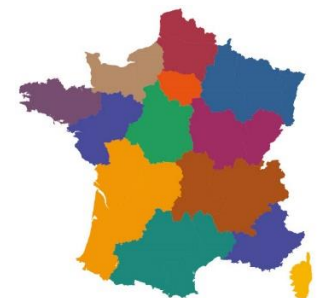
Floods – Regions of France